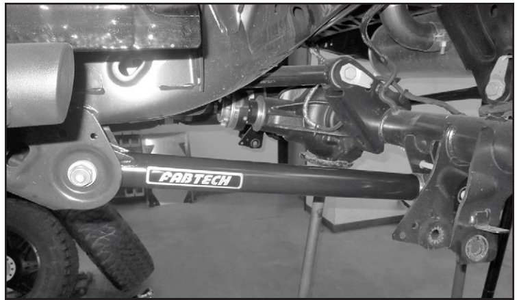
FIGURE 3 - STEP 4